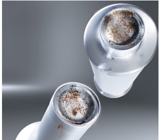
Corrosion on tablet tooling can delay production, reduce efficiency and cause contamination problems.

Traditionally, electro-plated hard chromium was the most popular coating used within the tablet tooling industry, but it has many disadvantages. When hard chromium is applied to tooling, a certain amount of hydrogen penetrates the substrate, which can decrease the steel's working load by up to 20%. To counter this effect, the plated tools undergo a baking process known as de-embrittlement that reduces but does not eliminate the unwanted characteristic. It is also subject to micro-cracks which can develop during the plating process when the internal stress exceeds the tensile strength of the chromium. These micro-cracks are problematic because they provide a porous route to the substrate that will allow granule or cleaning solutions to attack the steel beneath.